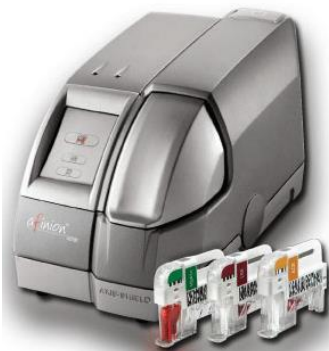
Afinion AS100 ACR, CRP, HbA1c, Lipids