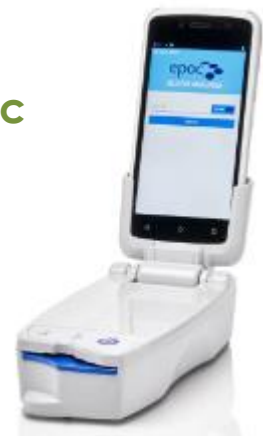
Siemens epoc Blood gas, Electrolyte, GLU, LACT, Hb + Hct