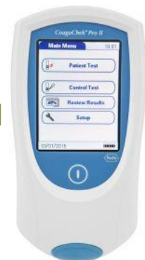
Roche CoaguChek Pro II INR