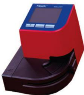
Hemocue WBC Diff WBC Count, 5-part Differential