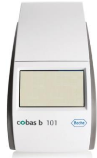
ROCHE b101 CRP, HbA1c, Lipids