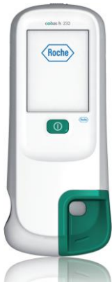
ROCHE cobas h 232: NT-proBNP, D-Dimer